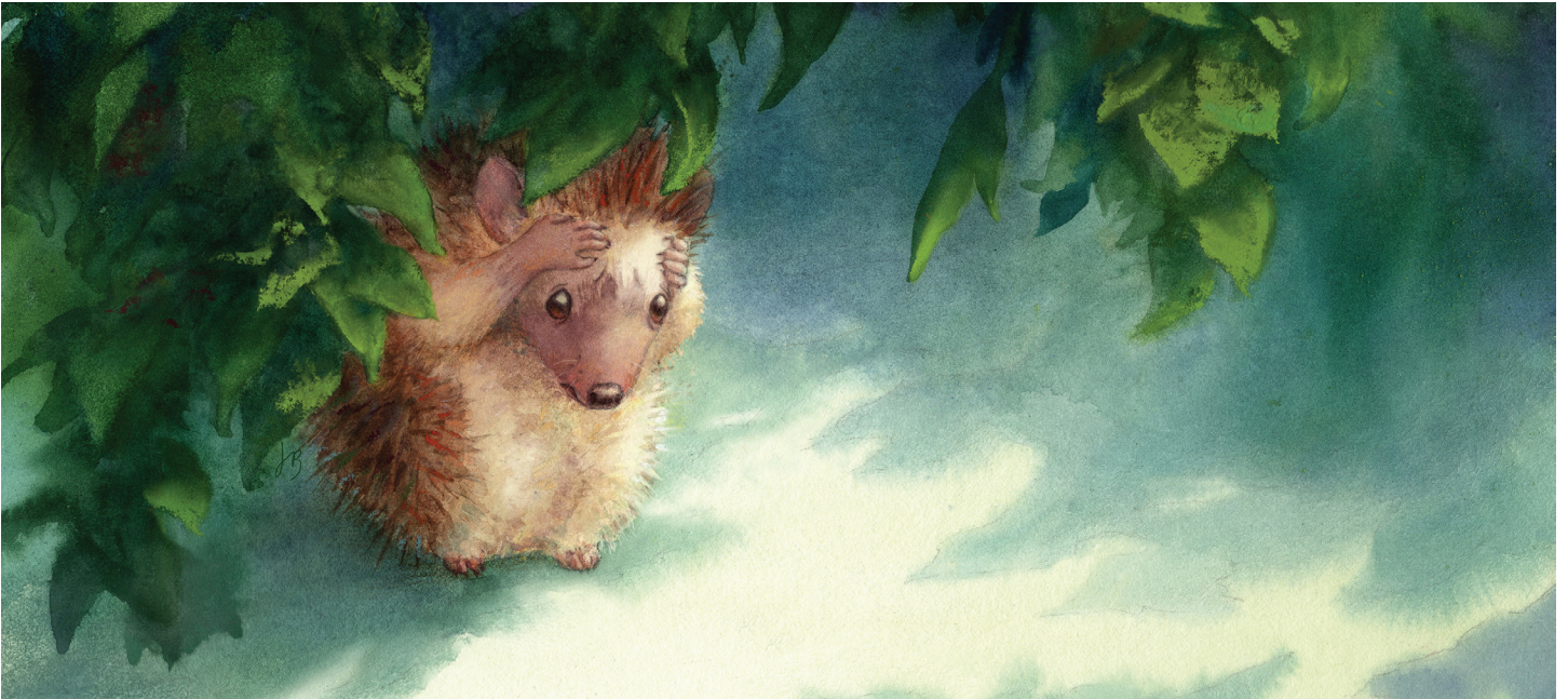
Image © Jen Betton, from the book Hedgehog Needs a Hug , published by Penguin Books. More materials available at www.jenbetton.com Discussion questions from www.onceuponapicture.co.uk