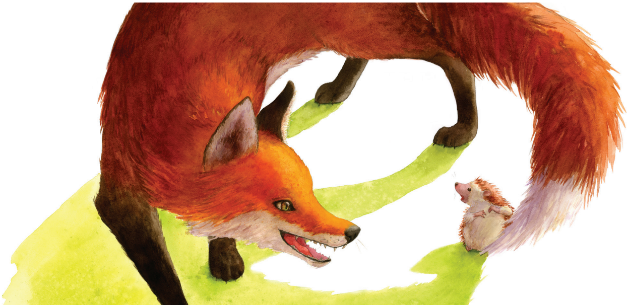
Image © Jen Betton, from the book Hedgehog Needs a Hug , published by Penguin Books. More materials available at www.jenbetton.com